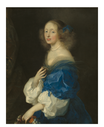
Image 8. Ebba Sparre. Sebastien Bourdon (1653). Collection: National Gallery of Art, Washington.

Anyone looking at portrait galleries from the seventeenth century will soon notice that certain poses keep recurring. Painters did not invent new poses every time, but reused them with the help of templates. In doing so, they did not limit themselves to citing their own work, but also drew on the production of others. They often worked with