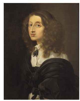
Image 11 (left). Basic portrait 1: Queen Christina with loose hair. Bourdon (1652). Private collection. Image 12 (right). Basic portrait 2: Queen Christina with curly hair. Bourdon (1653). Collection National Museum Stockholm. Image 13 (below) Basic portrait 2 copied in the canvases for Philip IV: the armchair portrait and the equestrian portrait.