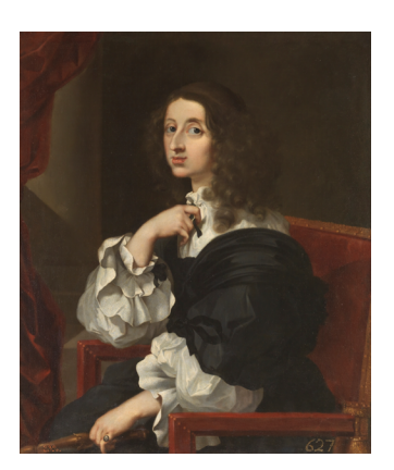
Image 10. Queen Christina in an armchair. Sebastien Bourdon (1653). Collection: Museo del Prado Madrid.

(image 10) and the equestrian portrait, were derived from the second basic portrait. When looking at this one and the two canvases for the Spanish king, it is immediately clear that Christina's head is depicted almost identically in these paintings. (See image 13.) Looking at the original paintings, it is also clear that the person portrayed is always depicted at natural size. The tradition of portraiture had spawned this aesthetic standard, which brought with it an important additional advantage that stencils were always the right size. It also meant that painted portraits usualy had more or less standard heights. A chest portrait of an adult was about 80 cm. in height, a half-high portrait about 105 cm., a portrait up to the knees 150 cm. and a full-length portrait of 200 cm.