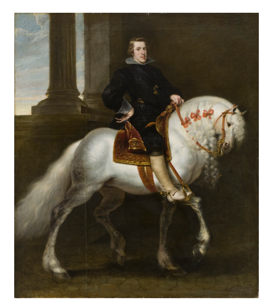
Image 4. Equestrian portrait of King Philip IV of Spain. Anonymous Flemish master. Collection: National Museum Stockholm.