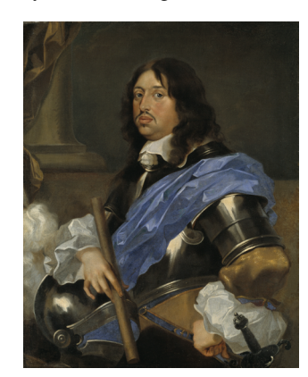
Image 9. Crown Prince Karl X Gustav. Sebastien Bourdon (1653). Collection: National Museum Stockholm.

sheets in which the contours had been perforated, so they could be applied to the canvas with charcoal for the underlying drawing. The same method was used to make copies of portraits or to compose double portraits or group portraits from existing individual portraits. To properly fill in the faces, the copyist needed the original as an example, or at least a detailed sketch or chalk drawing on paper.<sup>13</sup>