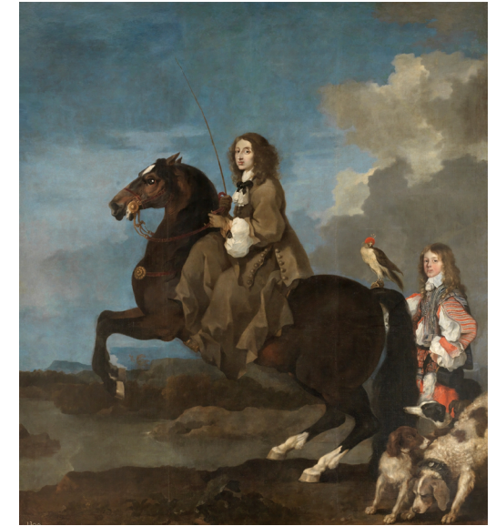
Image 1 and 2. Left: Archduke Cardinal Ferdinand of Austria on the battlefield of Nördlingen by Peter Paul Rubens(1634-1635). Collection: Museo del Prado Madrid. Right: Equestrian portrait of Queen Christina of Sweden by Sébastien Bourdon (1653). Collection: Museo del Prado Madrid. The two canvases hung side by side in the dining room of the royal palace in Madrid, the Alcázar.

publications about this well-known painting by Sébastien Bourdon have become infected with it. That has some significance, because the dimensions play a special role in the history of the canvas.