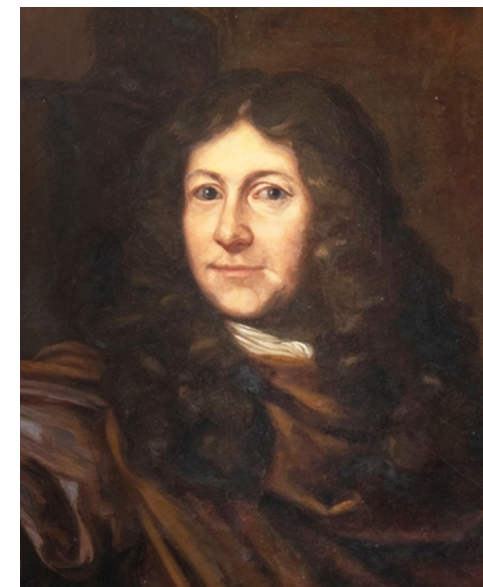
Image 7. Mathias Palbitzki. Copy (fragment) after Ehrenstrahl (1665).

ving south 8 and that she is leaving dark Sweden behind. It indicates her intended abdication and subsequent conversion journey to the south. Philip IV and Pimentel were among the few who knew about it.