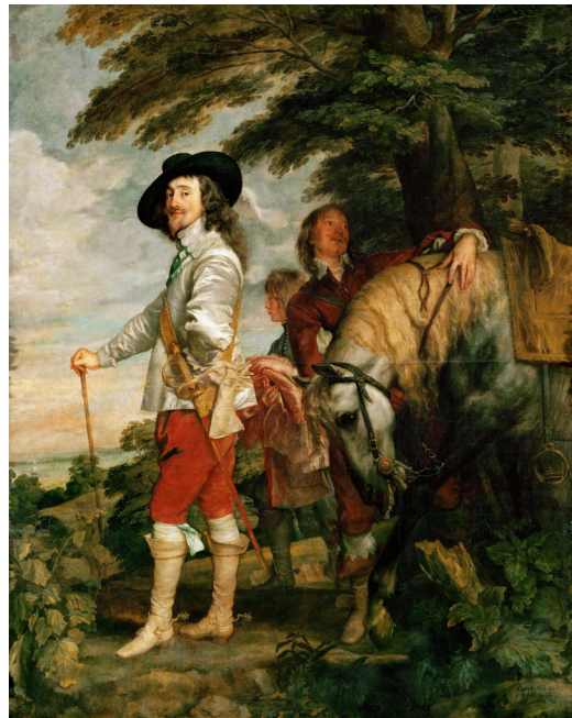
Image 14. Charles I on the hunt. Anthony van Dyck (c. 1635). Collection: Louvre Paris.