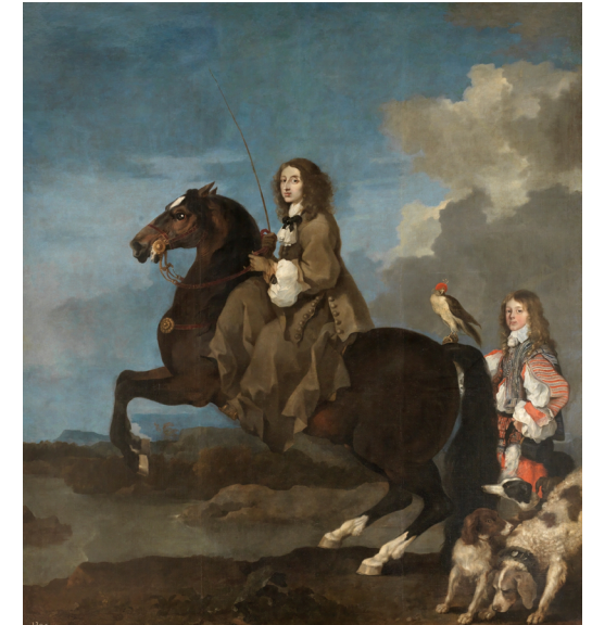
Image 1 and 2. Left: Archduke Cardinal Ferdinand of Austria on the battlefield of Nördlingen by Peter Paul Rubens (1634-1635). Collection: Museo del Prado Madrid. Right: Equestrian portrait of Queen Christina of Sweden by Sébastien Bourdon (1653). Collection: Museo del Prado Madrid. The two canvases hung side by side in the dining room of the royal palace in Madrid, the Alcázar.

publications about this well-known painting by Sébastien Bourdon have become infected with it. That has some significance, because the dimensions play a special role in the history of the canvas.