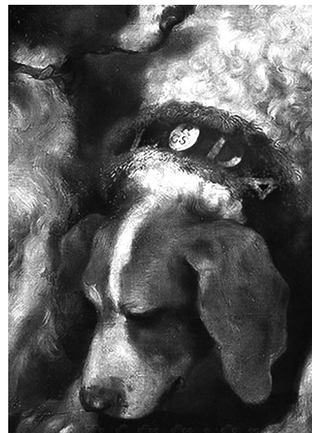
Image 3. On the collar to the left of the medal the L of Legatus , to the right DA of Dominus Antonius . On the medal itself the initials CRS of Queen Christina.