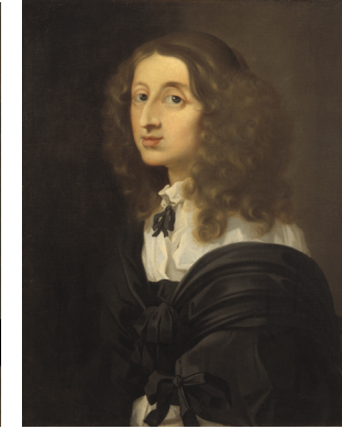
Image 11 (left). Basic portrait 1: Queen Christina with loose hair. Bourdon (1652). Private collection. Image 12 (right). Basic portrait 2: Queen Christina with curly hair. Bourdon (1653). Collection National Museum Stockholm. Image 13 (below) Basic portrait 2 copied in the canvases for Philip IV: the armchair portrait and the equestrian portrait.