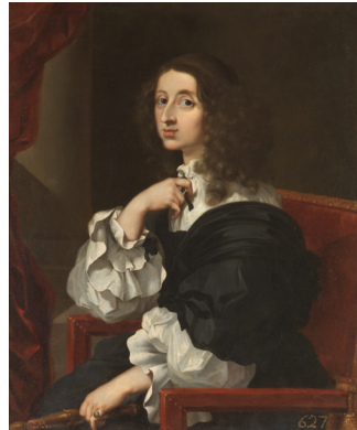
Image 10. Queen Christina in an armchair. Sebastien Bourdon (1653). Collection: Museo del Prado Madrid.